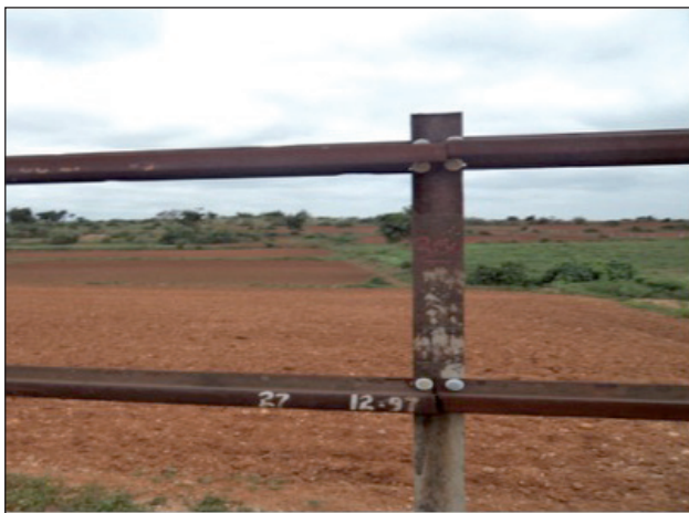
Figure 2. Horizontal bars are connected to the vertical bars with nuts and bolts.

Horizontal and vertical bars were connected by four nuts and bolts (Fig. 2), and vertical bars were buried about a metre in the ground. The total length of the barrier was 9.953 km (Fig. 3), with 7.585 km in the Thattaguppe beat of Bannerghatta Range and 2.249 km in and Kodihalli Range of