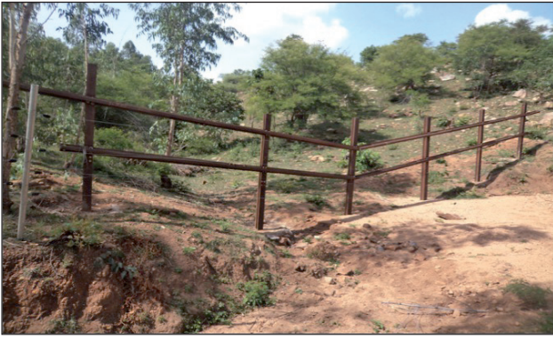
Figure 4. Railway line barrier used for supplementing solar electric fence along water channels in Gowdahalli Beat, Kodihalli Range.

was agriculture with other vegetation and bare land consisting of the remaining. In Kodihalli Range, there were no houses on either side of the railway line barrier. Inside the protected area, it was completely forested. Outside the barrier half of the land-use was agriculture with the remaining being covered by other natural vegetation or bare land. Twelve water bodies were found along the railway line barrier in BNP out of which 3 were in Hanchuguli beat and one was in Gowdahalli beat of Kodihalli Range, and the other 8 were in Thattaguppe beat of Bannerghatta Range. All the water bodies were on the protected area side along the railway line barrier except for one in Thattaguppe beat.