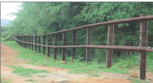
Figure 5. Railway line barrier with integrated electric fencing.

Elephant-proof trenches were found along 7.6 km of the rail barrier and had 14 breaches amounting to a length of 0.971 km. Most (85%, n = 12) of the breaches were due to natural causes such as sludge, silt or debris deposition that reduced the depth of the trench. There was one breach from