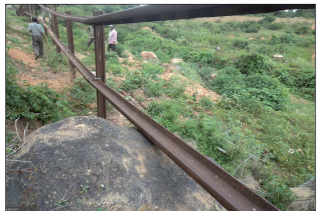
Figure 6. A boulder that possibly decreases the effectiveness of the railway line barrier.

Errors in construction of the rail barrier seemed to be considerably high. A total of 43 bolts connecting horizontal and vertical bars were missing, with 37 in Bannerghatta Range and 6 in Kodihalli Range. The soil below vertical bars