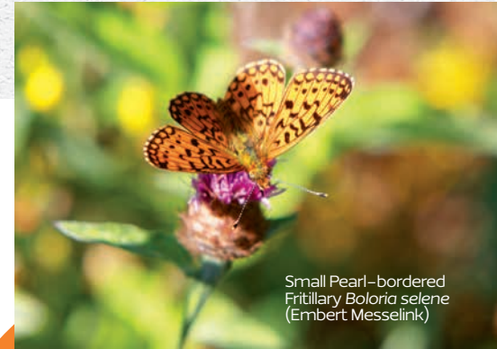
Small Pearl-bordered Fritillary Boloria selene (Embert Messelink)