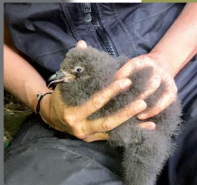
Grey-faced Petrel or Oi (A Rocha Aotearoa New Zealand)