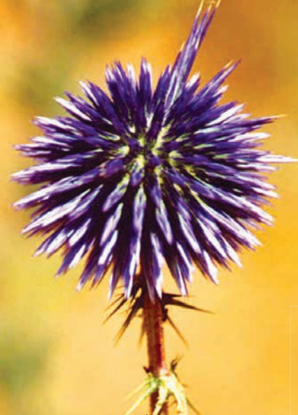
Viscous Globe Thistle Echinops viscosus (A Rocha Lebanon)