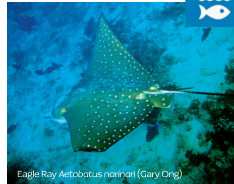
Eagle Ray Aetobatus narinari