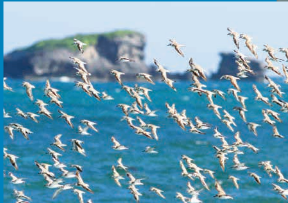
Waders in Kenya (Ben Porter)

The Red-faced Crombec Sylvietta whytii was recently mapped in the Dakatcha Woodlands inland of Malindi, marking the first recorded sighting of the coastal race of this African warbler for 40 years. A Kenyan endemic Hinde's Babbler Turdoides hindei was recorded in Nairobi suburbs, more than 50 km away from its previously known distribution. In addition to this, a Blue-spotted Wood-dove Turtur afer in Mau-Narok on the western edge of the Rift Valley is the most easterly record of the species in Kenya.