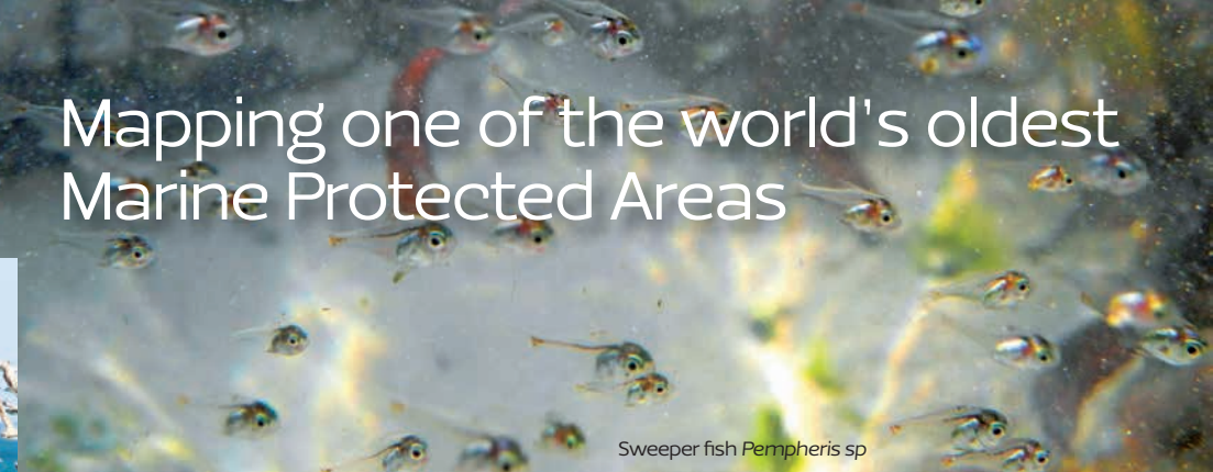
Sweeper fish Pempheris sp

A Rocha Kenya has completed a four-year study to collate all available historical information and establish the current status of the biodiversity and habitats that exist within Watamu Marine National Park. Although protected for 50 years, there has never been a comprehensive inventory of species, nor documentation of the range of habitats found within its boundaries.