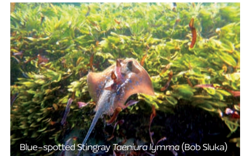
Blue-spotted Stingray Taeniura lymna (Bob Sluka)

We have produced the first habitat map of any Kenyan Marine Protected Area. We found that there are nine habitat types within the park, with seagrass as the most dominant and coral reef as the least widespread. This emphasizes the importance of non-coral habitats and the need for more research into the ecology and conservation importance of these habitats.'