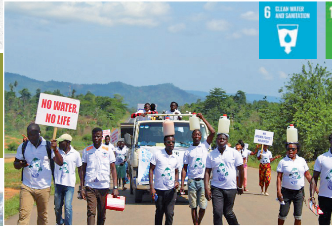
Walking for Water (A Rocha Ghana)

World-renowned biologist and environmentalist E.O. Wilson has written to the President of Ghana to highlight the unique biological value of the forest and the destruction that mining would cause. Professor Wilson reminds His Excellency President Akufo-Addo about Ghana's commitments to international agreements on biodiversity and sustainable development, and refers to the public support for a National Park at Atewa. Several international conservation organizations – including Amphibian Survival Alliance, Birdlife International, Global Wildlife Conservation, Rainforest Trust, the RSPB and WWF, together with A Rocha – have also written to the President of Ghana urging him to protect Atewa.