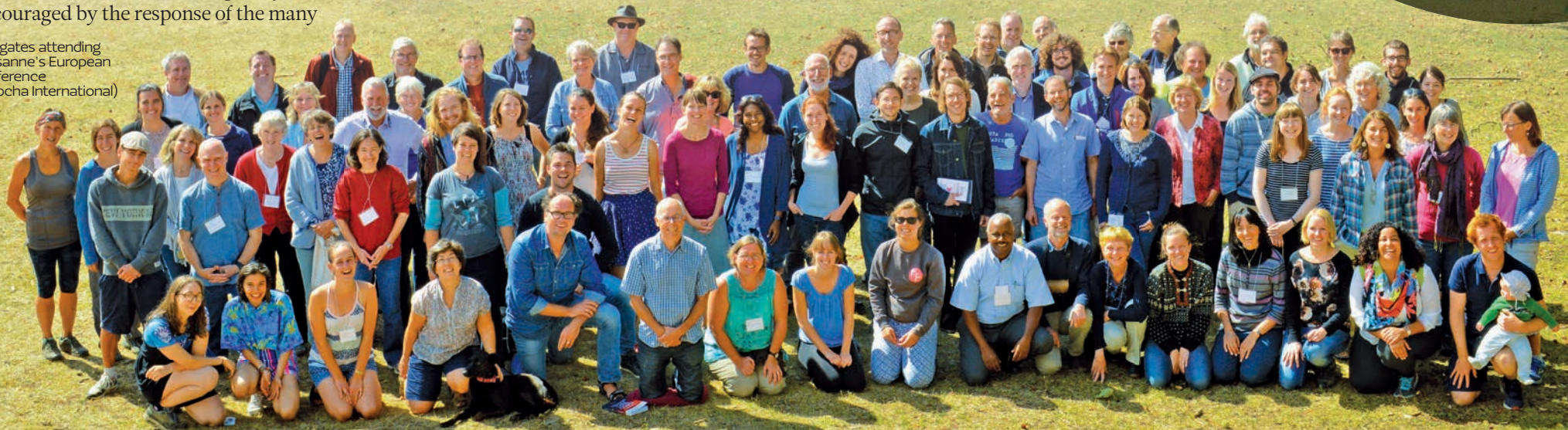
Delegates attending Lausanne's European conference

A Rocha UK's Eco Church continues to go from strength to strength. With over a thousand churches now registered, nearly 300 of which have already achieved awards, the programme helps Christians across the UK care for creation as an integral part of their faith. Following interest from other countries, preparations are underway to pilot Eco Church internationally. A Rocha UK is working in partnership with A Rocha International and other national organizations to develop ways of customizing the programme for different languages and cultures. For more information, contact ecochurch@arocha.org