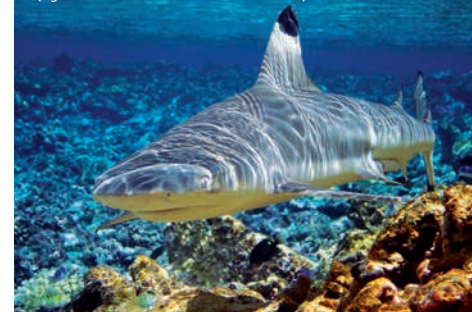
Blacktip Reef Shark Carcharhinus melanopterus

We have produced the first habitat map of any Kenyan Marine Protected Area. We found that there are nine habitat types within the park, with seagrass as the most dominant and coral reef as the least widespread. This emphasizes the importance of non-coral habitats and the need for more research into the ecology and conservation importance of these habitats.'