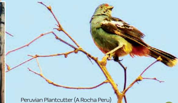
Peruvian Plantcutter (A Rocha Peru)