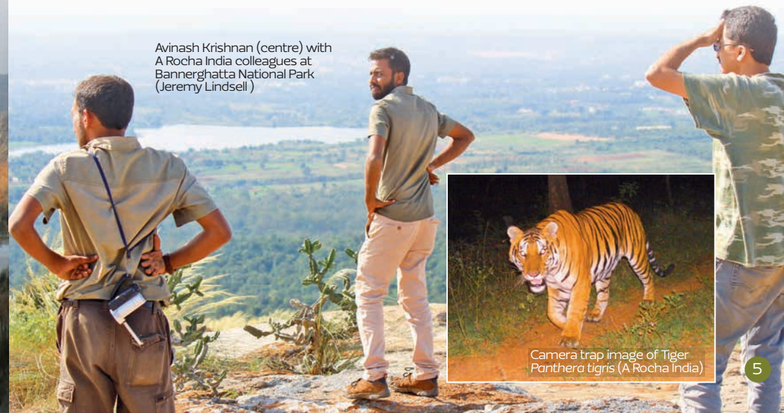
Camera trap image of Tiger Panthera tigris (A Rocha India)