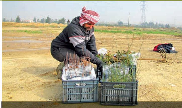
Planting trees and shrubs at Mekse (Martin Bernhard)

Working with the local municipalities of Mekse and Qab Elias, A Rocha Lebanon is bringing much needed green space for people and wildlife to the growing conurbation swallowing up Bekaa Valley farmland. By planting a mixture of indigenous and fruiting trees and shrubs, with laid out paths, streams and ponds, a fly-tipped waste land is turning into a haven for butterflies and birds and an opportunity for school children to learn about their environment right on their doorstep. Once the plantings are mature, the larger plot in Mekse will provide a unique, urban, green space for the local community, planted for them to enjoy and remember their place in God's creation.