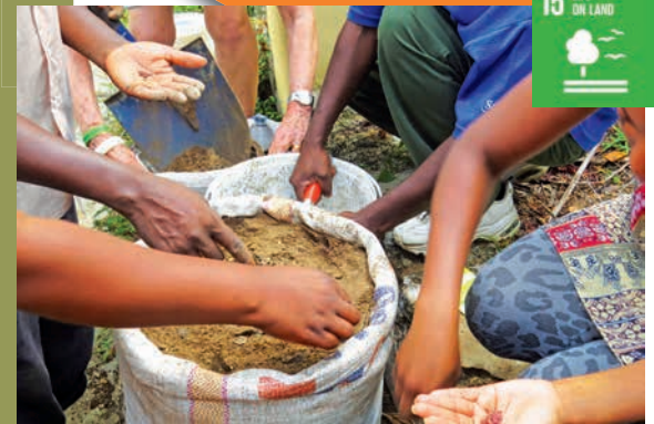
Learning how to make a sack garden (A Rocha International)

We saw an injured turtle at Watamu Turtle Watch and heard more about the problems caused by plastic litter in the oceans. We also observed a demonstration of how to make a sack garden; a great way to grow vegetables when you don't have lots of space.'