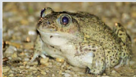
Western Spadefoot Toad (Thomas Alterr)