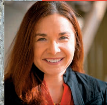
Dr Katharine Hayhoe delivered the 2017 John Stott London Lecture

Taking time out from the 2018 Leaders' Forum in Portugal to hunt for microplastics on a local beach.