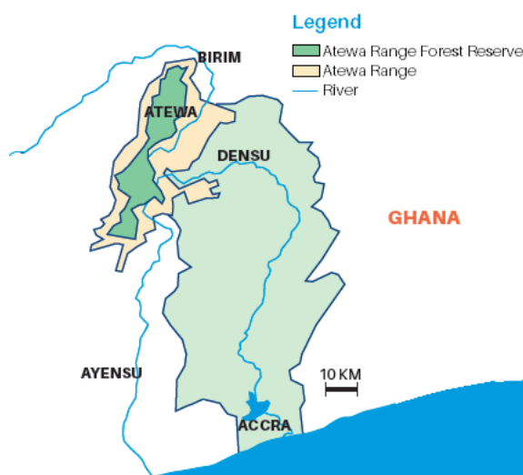
Figure a: Atewa Range Forest Reserve (dark green), the Atewa range (dark green + yellow) – the primary study area - and the three river basins which it supports (Densu, Birim and Ayensu)

Atewa is at a crossroad and the people of Ghana need to choose a sustainable development pathway or lose a valuable asset. Do nothing and let the forest steadily degrade, invest in establishing a national park and green developments, or extract all the timber and mineral resources in a limited time and forego the forest. All options have different costs and benefits, and affect different groups in different ways. The Economics of Atewa forest range valuation study helps stakeholders understand the consequences of these options. The study demonstrates the costs and benefits in economic terms of current developments in the Atewa Range compared to potential alternatives, and supports the Government of Ghana in deciding what the most optimal and sustainable management regime is for the Atewa Range.